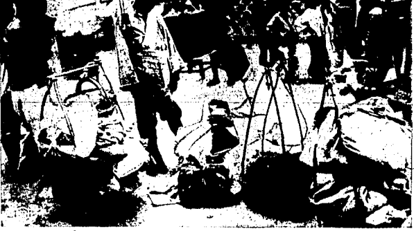
Chinese troops, stationed near Fensai search for concealed weapons in the bags of those entering the town as a threat of war hangs heavy in the latest Sino-Japanese controversy.