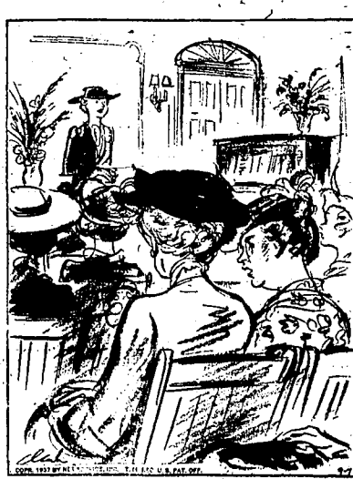
"We're paying her twenty dollars for this talk and she's insulting us right and left."