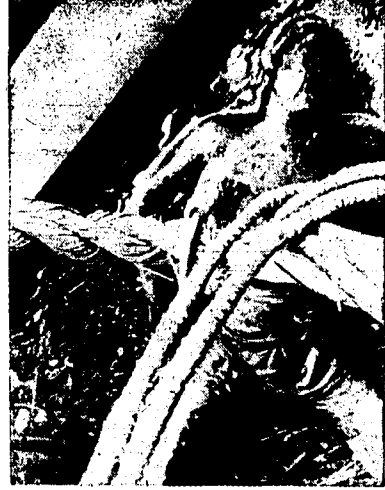
All the fearful, grotesque horror of war is encompassed in the distorted features of this Chinese native as he lies in the debris aside Soochow creek, where a bomb felled him—a casual, incidental victim of war.