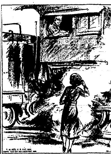
"Now do try to get in on time this evening. We're having guests for supper."