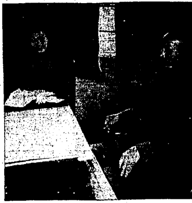
Smiling and at ease, China's leader, Generalissimo Chiang Kai-shek, and his charming American-educated wife Madame Kai-shek, are shown in the general's headquarters at a press conference with American correspondents. It is the first picture taken of them together since Japan launched hostilities. Dark curtains are drawn over the windows to blur a target for bombers.