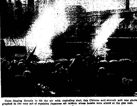
Guns blazing fiercely to fill the air with exploding steel, this Chinese anti-aircraft unit was photographed in the very act of repulsing Japanese air raiders, whose bombs were aimed at the gun nest.