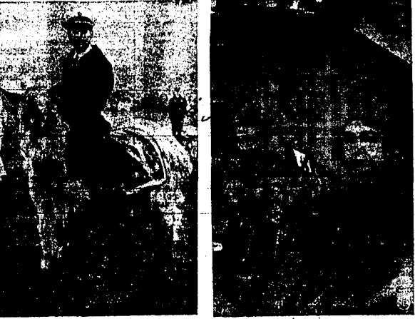
Army had Navy's goal even before the game brought a 6-0 victory—had it in the form of the mule-in-goal clothing which the Cadet clearing squad paraded before the game.