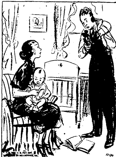
"Listen, Doctor, we're afraid he has swallowed the page that tells what to do if he should swallow something."