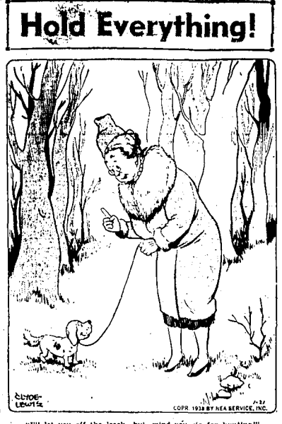
"I'll let you off the leash—but, mind you, no fox hunting!"

FOR SALE AUTO DOOR GLASS WINDSHIELD AND WINDOW GLASS. No charge for labor setting glass if you will bring your auto or drive your car in. Phone 516.