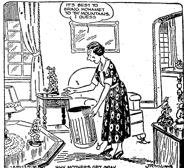
WHY MOTHERS GET GRAY