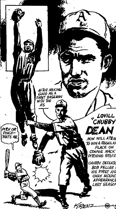
HIS BATTING ABILITY MAKES HIM DOUBLY VALUABLE AS A PINCH HITTER...