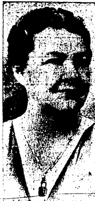
REP. MARY NORTON ... Demands showdown vote on her wages and hours bill in house.