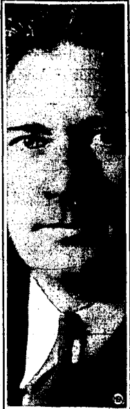
GOV. PHIL LAFOLLETTE ... Will tell liberal supporters tonight whether he intends to launch a new national third party movement.