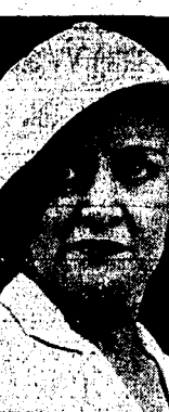
Portrait of a man, likely related to the rift rumor article.