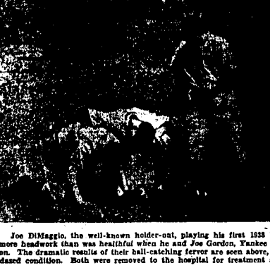
Joe DiMaggio, the well-known holder-out, playing his first 1938 ball game with the Yanks against Washington, became involved in a little more headwork than was beautiful when he and Joe Gordon, Yanks infield star, both chased a high pop and crashed into each other head-on. The dramatic results of their ball-catching frenzy are seen above, where DiMaggio knocked out cold and Gordon wobbled on his knees in baced condition. Both were removed to the hospital for treatment and observation where it was found that neither was seriously hurt.