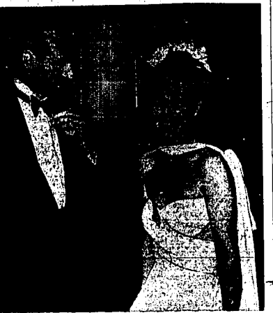
In all his travels, Marco Polo probably never had as charming a partner at a dance as has Gary Cooper in the photo above, where he is seen with Joan Crawford at the recent party of the Screen Actors Guild in Hollywood's Cocoanut Grove. La Crawford, resident in a new hairdresser and unusual evening gown, is evidently being amused by the famous Cooper pillared comports.