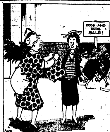
"Look, Hattie, I got a remnant that just matches my dress!"

AUTO SUPPLIES 3-3000s new tractor tires for sale cheap. Inq. Orange Transportation Co. Phone 630. LOST AND FOUND LOST—White female French poodle. Reward. 1500 8th Ave. E.