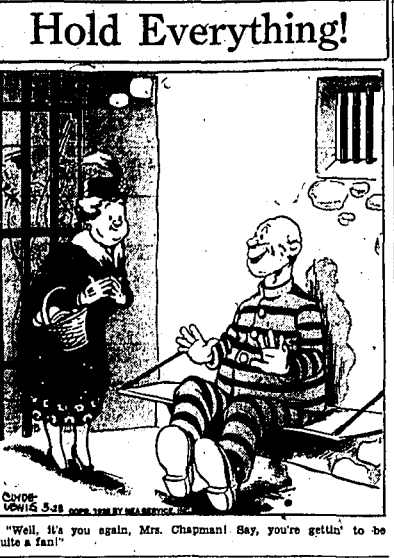
"Well, it's you again, Mrs. Chapman! Say, you're gettin' to be quite a fan!"

Quick Loans $5 and UP ON YOUR SIGNATURE ONLY Employed people who need cash, solve your problems here.