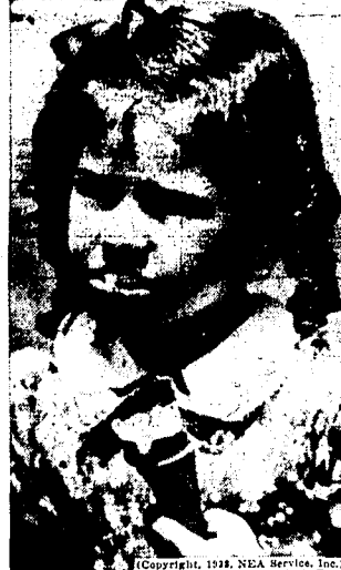
Emile, too, is more eager for results than fitness when it comes to beating midsummer heat.