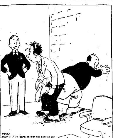
"You might have been a good blacksmith, son, but I'm afraid you're not quite ready to be a stove salesman."

PETS GERMAN Roller canaries, Ph. 1009. FOR SALE: Lowellyn setter puppies, 6 wks. old. 652 4th ave. east.