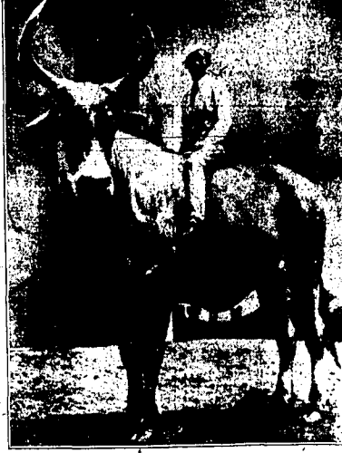
Lena Star, claimed to be the largest and tallest milch cow on earth, weighing 3,005 pounds, will be seen in Twin Falls for two days and nights, Thursday and Friday, July 28 and 29, as a part of the big show at the Hippodrome show. The exhibition, housed on its own special railway cars, will be located on the Union Pacific tracks opposite the passenger depot. It will open to the public from noon to 10 p. m. daily.