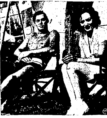
Separations of Johnny Weismuller, the Tarzanic water star, and Lupe Vélez, his fiery Mexican actress wife, have been many during their five-year marriage. But Lupe says this time it's final. She's filed divorce suit, charging cruelty.