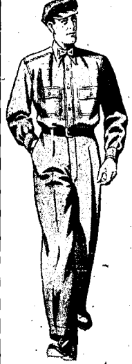
Made of dark tan cotton twill with heavy boat sail pockets. STURDY seams.