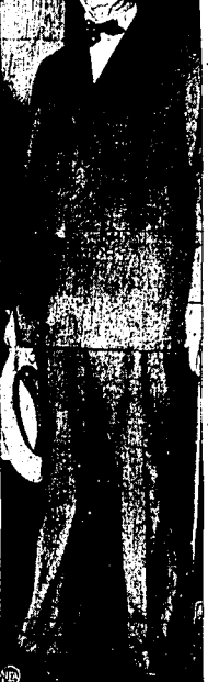
Idaho's William E. Borah, liberal lion of the senate, is pictured as he recently went outdoors in Washington for the first time to take an automobile ride, following a critical illness.