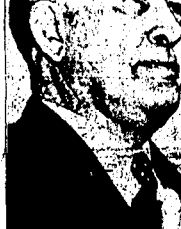
SEN. ALBEN BARKLEY

Chandler "reared like a bear" and Barkley "was brought up in the back of the senate" according to the President's son-in-law.