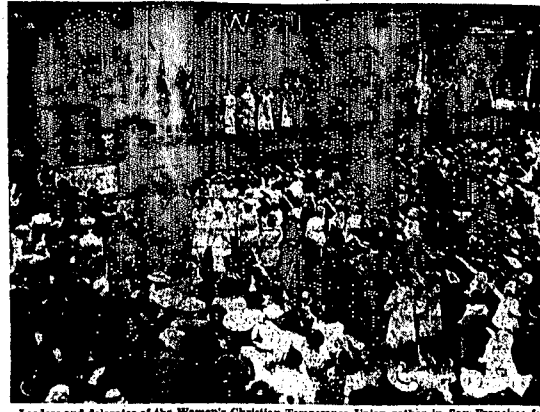
Leaders and delegates of the Women's Christian Temperance Union gather in San Francisco for their 64th national convention. Pictured here is the ceremony attending the opening of the convention, with delegates giving the pledge to the flag. On the stand, Governor Merritt, Mayor Ross and officials of the great women's temperance organization.