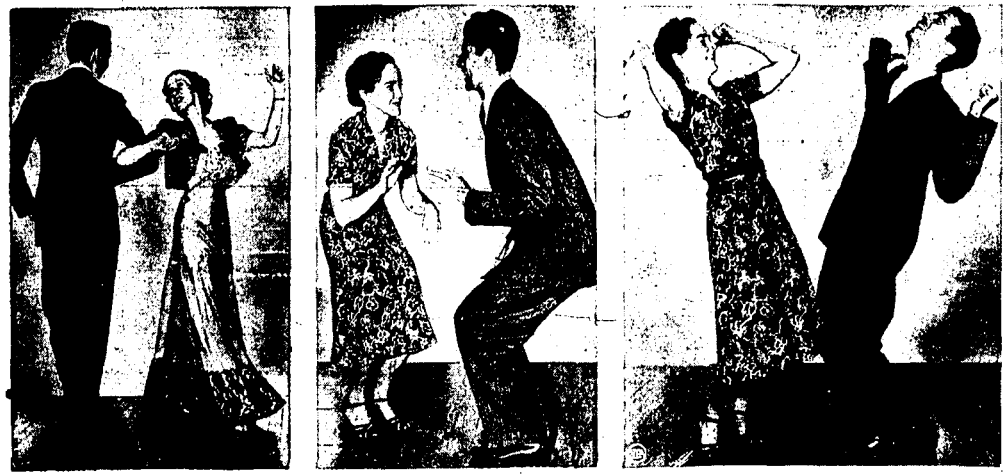
THE "WALK AROUND"—circle four steps THE "SLAP"—pat knees to music THE "HITCH-HIKE"—thumbs up and shout "Hey!"