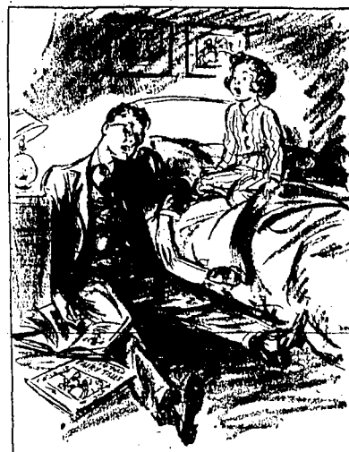
"Mama—Daddy has read himself to sleep again!"