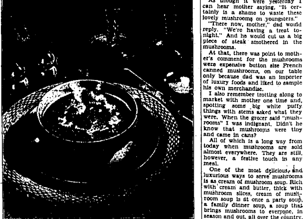
Cream of mushroom, a lavish soup, rich with cream and butter, is liked by one and all.