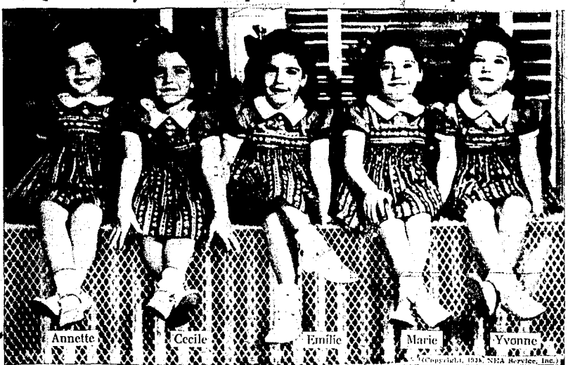
In splendid physical condition and smiling confidently, the Dionne quintuplets, pictured in their latest photo, were all set for operations—performed Nov. 9—to remove troublesome adenoids and tonsils.