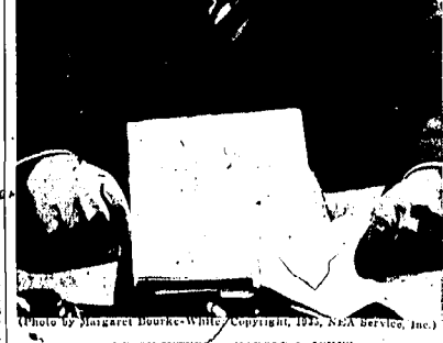
SEC. OF INTERIOR HAROLD L. ICKES