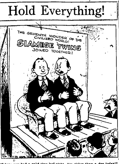
"I hope you had a good time last night—I'm sicker than a dog today!"

APARTMENTS FOR RENT FURN. apt. 212 4th Ave. East. FURN. apt. The Oxford Apts. JUSTAMERE Inn, Ph. 455 One-97.