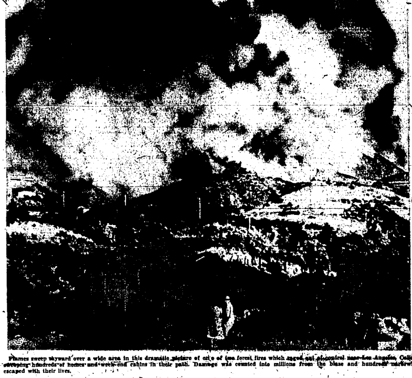
Flames sweep skyward over a wide area in this dramatic picture of one of the forest fires which swept out of control near Los Angeles, California, hundreds of homes and weeks of cabins in their path. Damages were estimated in millions from the blaze and hundreds narrowly escaped with their lives.