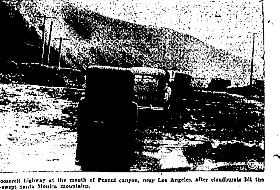
This is Roosevelt highway at the mouth of Peanut Canon, near Los Angeles, after cloudbursts hit the recently fire-swept Santa Monica mountains.