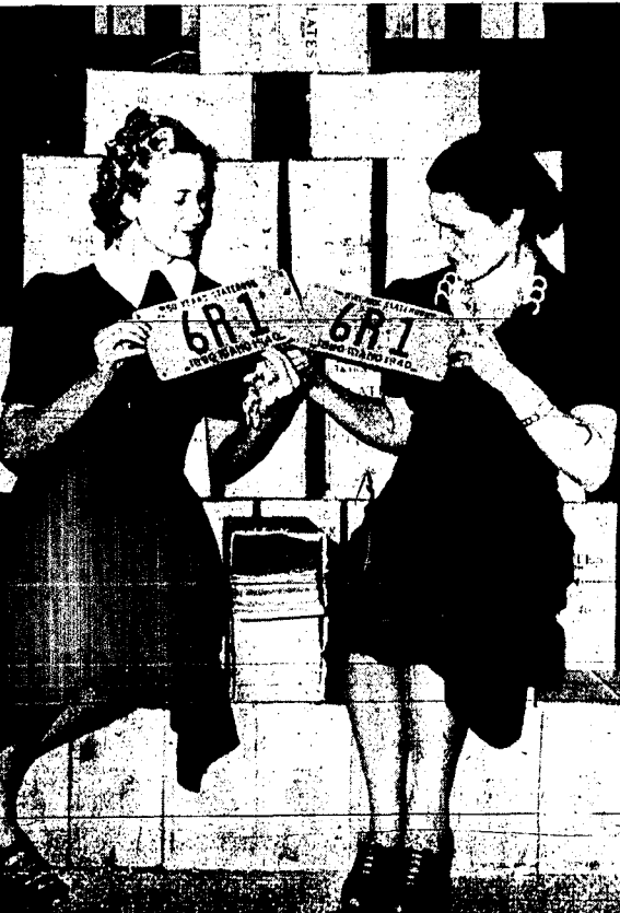
Offering a new departure in policy for Idaho's auto license plates, the 1940 version carries Idaho advertising with the reminder that the state is now in its 50th year as a full-fledged member of the union...