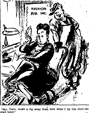
"Say, Toole, shake a leg away from here while I fit this short-circuited lamp!"