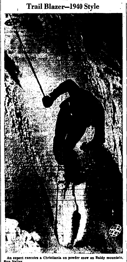
An expert executes a Christiana on powder snow on Baldy mountain, Sun Valley.

GOODING, Jan. 12 (Special)—With an all-star entry list for the 1940 tournament that is expected to be the best on record, the annual Gooding Outlaw tourney will be staged here on Thursday, Friday and Saturday, Feb. 15, 16 and 17, it had been announced today after a meeting of the Gooding Junior Chamber of Commerce last night.