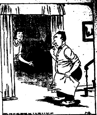
"But of course I've got the lights off, Father—this is a blind date!"