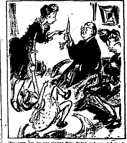
"I'm sorry, but she was playing Peter Rabbit and expected you to eat the carrot!"