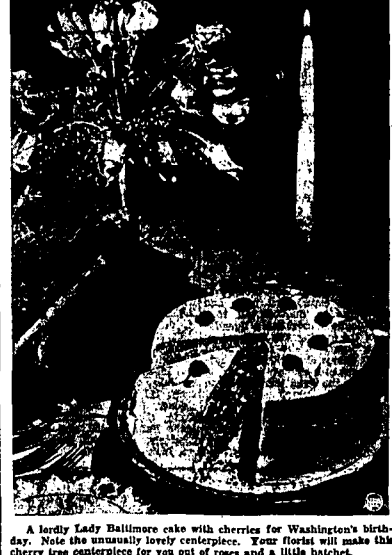
A lardy Lady Baltimore cake with cherries for Washington's birthday.

Mount Vernon Tradition... A lardy Lady Baltimore cake with cherries for Washington's birthday.