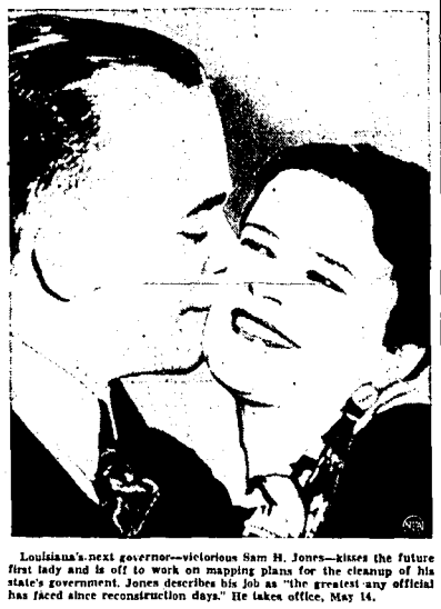
Louisiana's next governor—victorious Sam H. Jones—braces the future first day and is off to work on mapping plans for the cleanup of his state's government. Jones describes his job as "the greatest any official has faced since reconstruction days." He takes office, May 14.