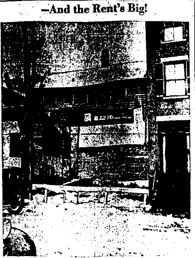
Some one stole two floors of the Albany, N. Y., house not shown above. When last seen they occupied the space directly below the attic—all that remains of the wooden home. Police investigating this unusual theft believe the house was taken apart piece by piece and carried away for fuel during recent cold snap.