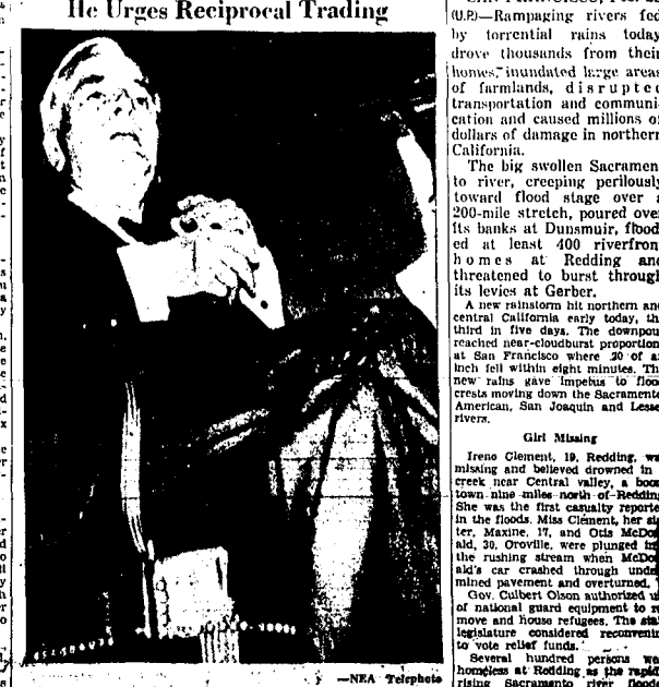
A cameraman caught Secy of State Cordell Hull in this unusual angle "shot" as he testified before a U. S. senate committee in Washington, Monday, during continuation of his reciprocal trade program for rebuilding international relationships.