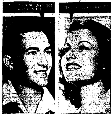
Jeffrey Lynn and Ann (Oomph) Sheridan... a clinch is just a job to them.

"Does my right arm look okay?" asked Mr. Lynn, never altering his soulful gaze. "Hurry up, you lugs! I'm due over at wardrobe right now," said Miss Sheridan through parted, expectant lips. The camera clicked some more, and the couple relaxed. Jeff's impatient. While the actor sat on the couch, Miss Sheridan wriggled around so that she reclined in his arms. She registered rapture. His possessive clasp looked like a little illustration for "Haven't you got enough stuff?" "You finished with the picture, Jeff?" she asked. "Nah," he snarled through a tender, half-mile of sheer ecstasy. "Gotta couple retakes tomorrow, and I wanted to go to the races. Say, haven't you got enough stuff?" "Just a little longer," begged the boss photographer. "Amie, how about turning on a little more of the well-known." "If you say 'oomph,' I'll strangle you," warned Miss Sheridan. "Well, don't strangle 'ME!" protested Lynn, who was looking pretty pink. Your correspondent tiptoed out. It was more disillusionment than I could bear. You Won't Hear This Film I went around to Stage 12, where they're making a picture called "The Shell Meet Again." George Brent calls it "Six Characters in Search of a Director." Edmund Goulding started it, fell ill, William Keighley substituted for a while. Goulding returned, had a relapse, and now