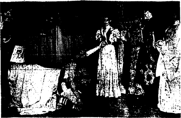
Senior class ingenuity in "lying in" the current Confucius feud with the district basketball tournament...