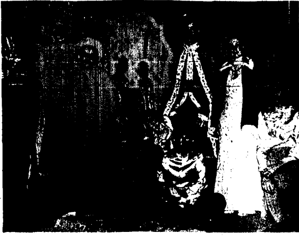
Here are part of the colorful characters in "White Gypsy." Twin Falls Junior high school operetta which will be presented for the public at 8:15 p. m. Friday.