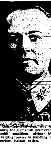
Portrait of a man, likely the Rumanian boss mentioned in the text.