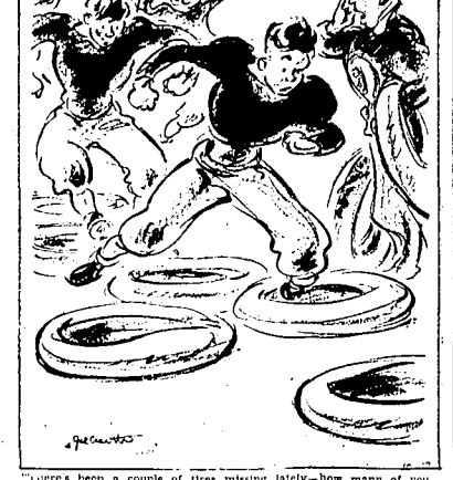
Here's been a couple of tires missing lately—how many of you kids own jalopies?