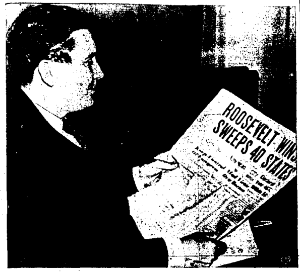
After dispatching a telegram to President Roosevelt conceding that he had been reelected, Wendell Willkie sits down in his New York hotel headquarters to read election results. He called upon his followers to "work for the unity of our people."