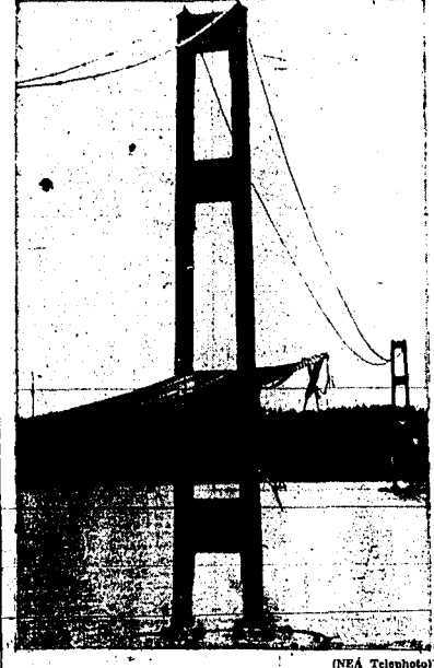
Whipped by a 32-mile-an-hour windstorm, the Tacoma narrows bridge, third longest suspension span in the world, collapsed as a 100-foot center section of the $6,400,000 structure fell into Puget sound. While spectators watched from the shore, the bridge swung and twisted, finally fell loose, spilling three autos into the water below. The span was completed in mid-summer.