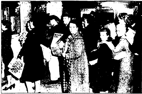
Here's part of the lineup in the Twin Falls postoffice lobby. Scenes like this in every postal office in the country explain the avalanche of packages and Christmas cards that keep mail carriers on the jump and make the Christmas season "the best feet-holiday" for postal folk.