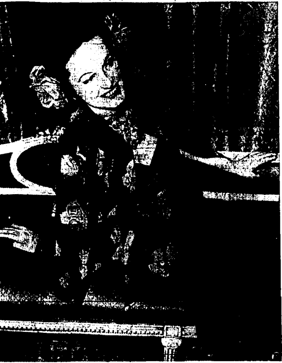
Keeping abreast of front page news, American designers found inspiration in the embattled democracies of China, Greece and Great Britain for several ensembles. Above, Fashion Futura designed loyalty to China...