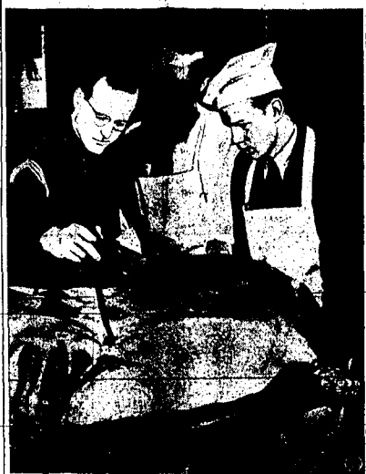
Unique in higher education is the course in men management offered to advanced military students at the University of Idaho.