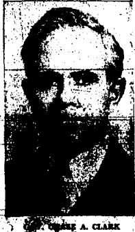
GOV. CHASE A. CLARK