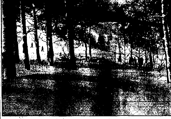
Varied ski runs aren't the only features awaiting visitors to Magic mountain, ski site which is drawing more visitors weekly to the Rock Creek area. This photo shows the scenic beauty that offers an added attraction at the mountain. One of the ski runs is in left background.