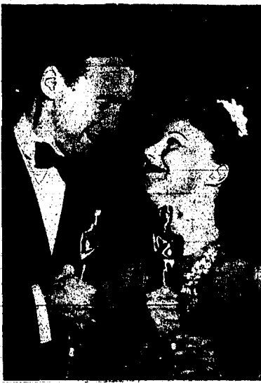
Hollywood's best performance awards for the cinema season of 1940—in the form of Oscars—go to Ginger Rogers for her performance in "Kitty Foyle," and to Jimmy Stewart for his work in "The Philadelphia Story."