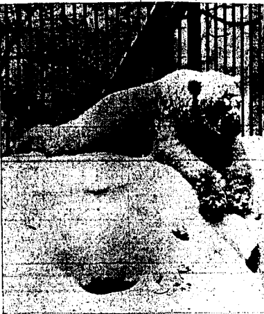
As blizzard swept northeastern U. S., happiest citizen was this polar bear at the Philadelphia zoo.