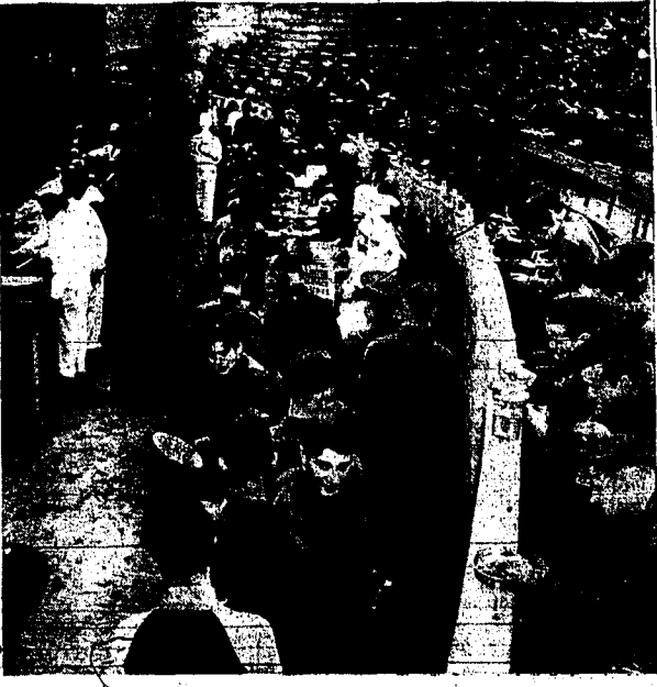
From a stadium where huge audiences gathered to witness Olympic games to football championships, Los Angeles Coliseum has become a temporary armed camp for 1,250 members of the 160th Infantry, California national guard, mustered for active duty.