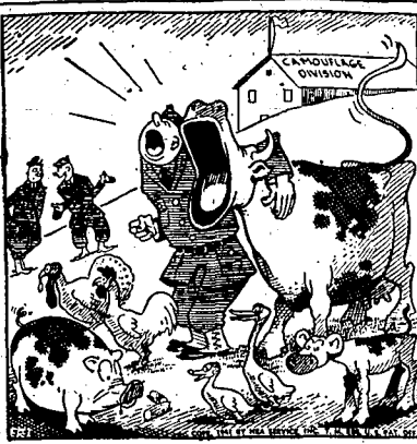
"He's learning barnyard imitations to fool the enemy!"