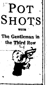
The Gentleman in the Third Row