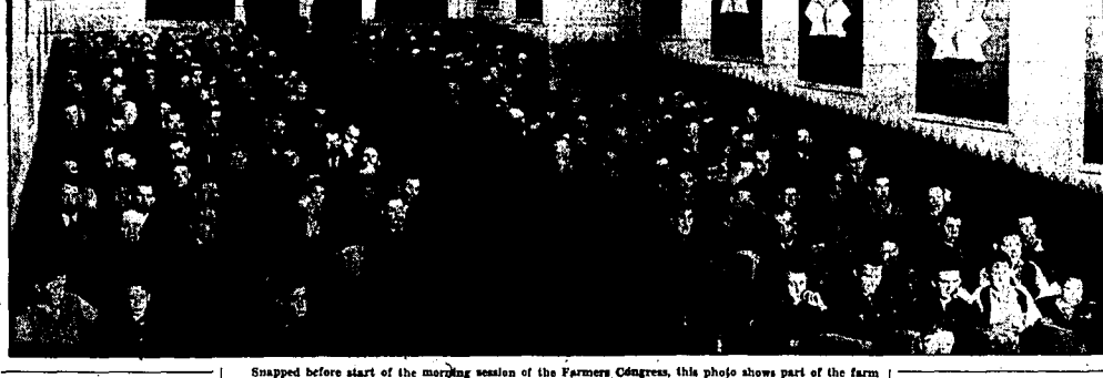
Snapped before start of the morning session of the Farmers' Congress, this photo shows part of the farm and urban group which attended gatherings of the fourth annual event today. The morning conference, featuring two dinners and motion pictures, was held at the Roxy theater.