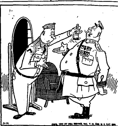
"And the platinum medal, my boy, is for winning an argument with my wife!"