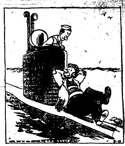
"These are my friends, Pop—they just happened to be walking past."