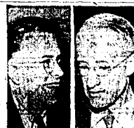
E. O. Lawrence Joel Hildebrand

atom smasher is building a gargantuan $2,000,000 cyclotron on the campus, but he's a familiar figure on Berkeley's colorful rink which he helped build.