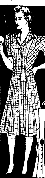
Pattern 5385 will be ordered only in women's sizes 36, 38, 40, 42, 44, 46, 48 and 50. Size 36 requires 4 1/2 yards 3 1/2 inch fabric and 2 1/2 yards lace edging.