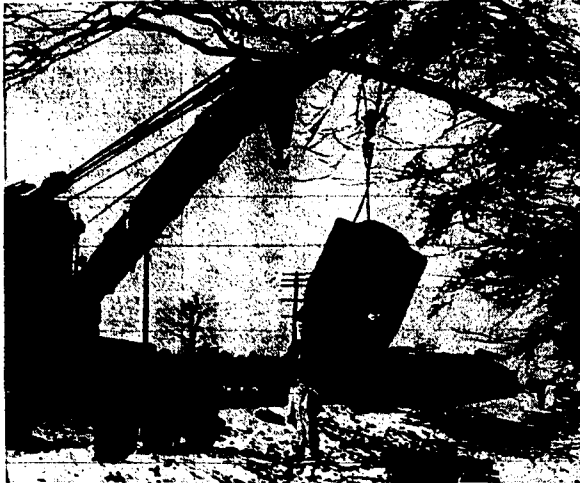
A huge derrick picks up one of the smashed cars of a nine-car train wrecked when a speeding freight plowed into it near Savannah, O. Three hundred defense workers, bound for the government's $19,000,000 Savannah arsenal, were injured in the crash. Note overturned engine in the background.