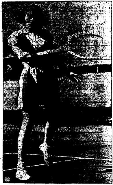
Pauline Betz ... has all the aho.