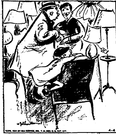
"Just let him play around that desk for a few minutes—if it doesn't tip over I'll buy it."