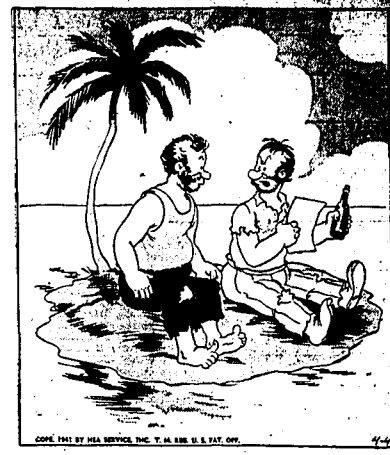
"It's an answer to the note we sent out—says we have to report for the draft!"

R E D R Y D E R W A S H T U B E S B O O T S A L L E Y O O P F R E C K L E S O U R B O A R D I N G H O U S E