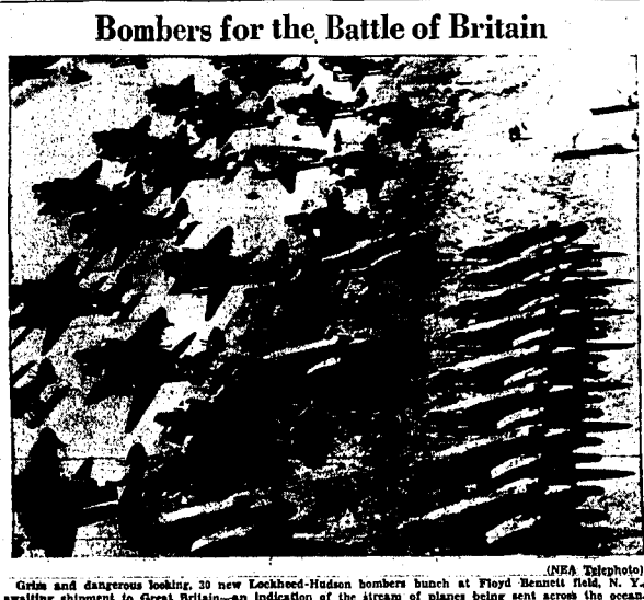
Grim and dangerous looking, 30 new Lockheed-Hudson bombers bunch at Floyd Bennett field, N. Y., awaiting shipment to Great Britain—An indication of the stream of planes being sent across the ocean. The bombers at left will be stripped of wings, as at the right, to be put on barges, then ships.