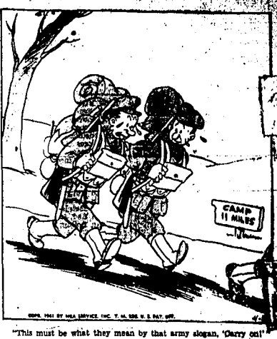
"This must be what they mean by that army slogan, 'Carry on!'"