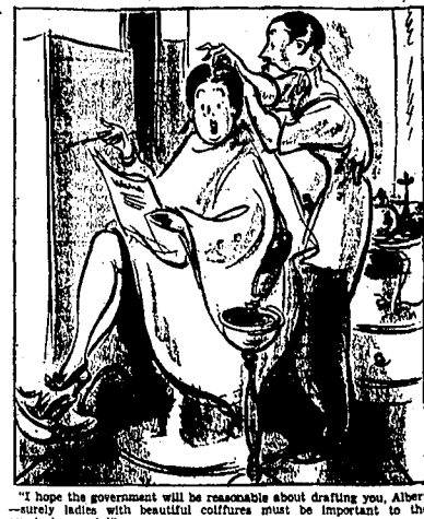
"I hope the government will be reasonable about forcing you, Albert—surely ladies with beautiful coiffures must be imprudent to the country's morale!"