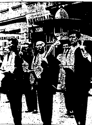
Hiller's boys did some historic mountain fighting in Norway, but if they try it again Yugoslavia they'll run into the "komitadjis," famed for centuries for their mountain warfare. Expert sharpshooters, the fearless komitadjis have never been dologged from their mountains. Here are some of them in festive dress.