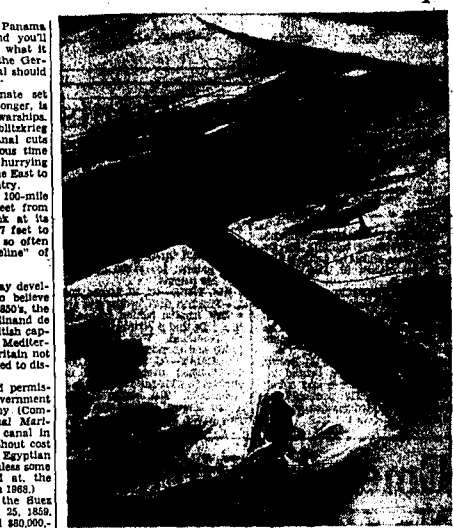
The desert-bordered Suez canal, pictured from an R. A. F. plane.

Actual construction on the Suez canal was begun on April 1, 1869. It took 10 years and $100,000,000 (Panama canal's cost $375,000,000) before, in November, 1869, the French emperor, Napoleon III, opened the canal to traffic.