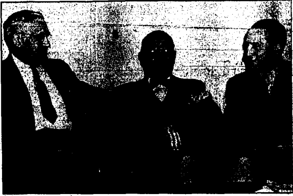
"Three happy fellows" might well be the title of the picture above, showing the three successful candidates in the municipal election held here yesterday.