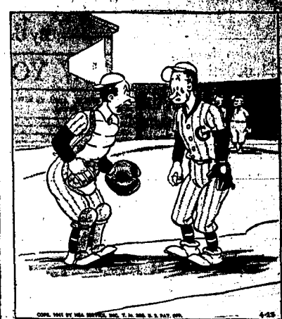
"Glad, bumper, the bases are full—now let's see the triple-play pitch you were telling that game about last night!"