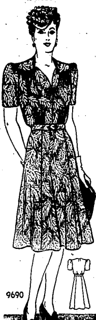
Pattern 9690 may be ordered only in women's sizes 36, 38, 40, 42, 44, 46, 48 and 50. Size 36 requires 3 yards 38 inch fabric.