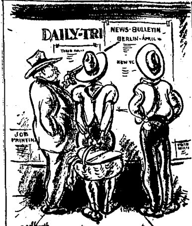
"I see old Hod is off the wagon—he's printing the letter B backwards again!"