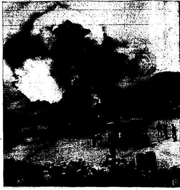
Clouds of smoke and flames pour from the muzzle of one of the Pacific coast's big defense guns at Fort Baker, at the Golden Gate at San Francisco, to make this spectacular photographic "shot." Long silent, the guns recently spoke in practice firing.