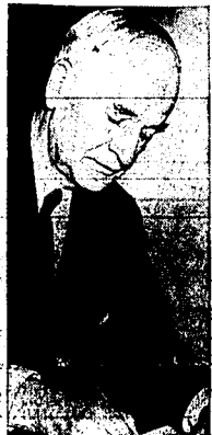
SECRETARY CORDELL HULL ... Fears France plans all-out war against former ally.