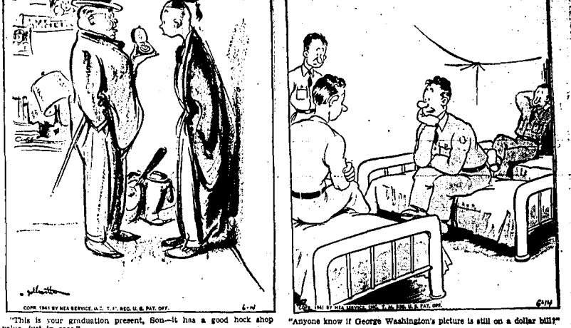
"This is your production present, Son—It has a good hook shop value just in case."