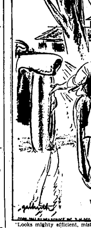
"Looks mighty efficient, mister—but will it smudge? He bend on my shoulder and whiny when I pat his back!"