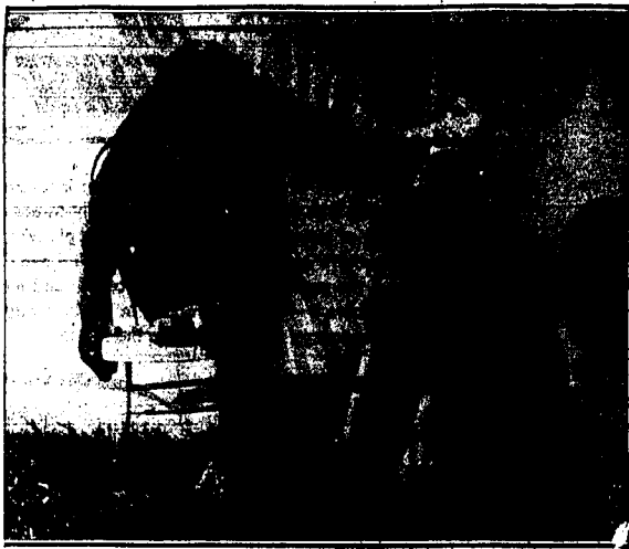
Highly-publicized attraction with the Patrick Greater shows, coming to Twin Falls June 30 for one week, is Pongo, the giant ape. Pongo requires a special keeper and also an air-conditioned cage because change in climate affects the big simian. The ape is shown above with a dog. The Patrick shows will be the center of the "Old Fashioned Fourth" celebration under auspices of the Junior Chamber of Commerce and the merchants' bureau. Also featured are the Billested circus and the famed Billested high-wire troupe. The show will operate at the old bath grounds.