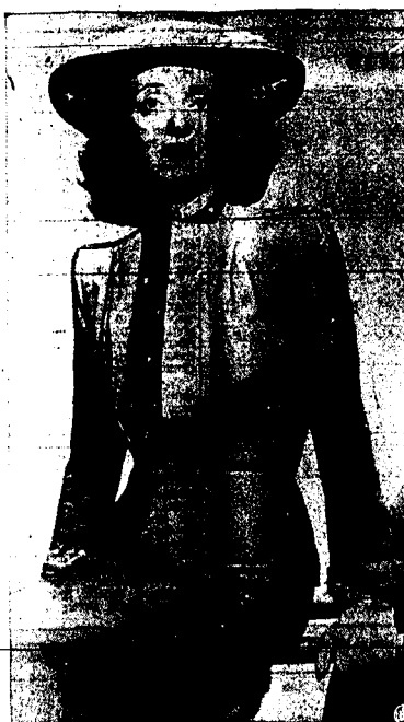
Bette Davis, famous screen star, models a summer suit that is perfect in country or suburbs and sure to be useful at a mountain or seaside resort.