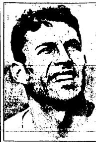
BOB FITZKE (Times Engraving)