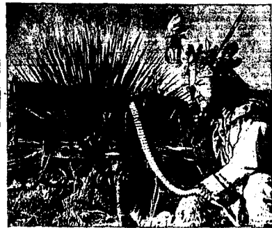
Pictureque—but misleading. Modern machine guns are still a mystery to the oldtime Indian Scouts.

MOTHERS PROTEST LITTLE ROCK, Ark.—The Army Mothers club of Little Rock and the Arkansas department of the American Legion today voiced protests against the action of Lieut. Gen. Ben Lear of the 2nd army in imposing mass punishment on 300 soldiers. "ANY TERMS" CAMP McQUAIDE, WATSONVILLE, Calif.—Soldiers of the 250th coast artillery challenged the "dog-hoos" at girls in shorts, didn't deter members of the 61st division passing through here en route to Fort Lewis, Wash. MORE "YOO HOING" OLYMPIA, Wash.—The walking diet meted out by Lieut. Gen. Ben Lear to members of his division last "yoo-hoos" at girls in shorts, didn't deter members of the 61st division passing through here en route to Fort Lewis, Wash. Girls employed at the courthouse, eating their lunch at city park near the highway, were bombarded by privates with numerous missiles, including rocks and apples. The factory value of motor vehicles, bodies, and parts made last year was $4,629,930,733, according to a recent report.