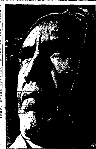
One of the famed Indian Scouts today—still "proud, dignified, loyal."