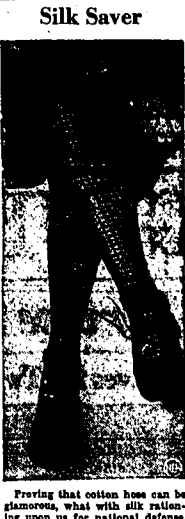
Proving that cotton here can be growing, what with silk raising upon us for national defense, are the cotton-clad underlines of Bath Ford of the movie.