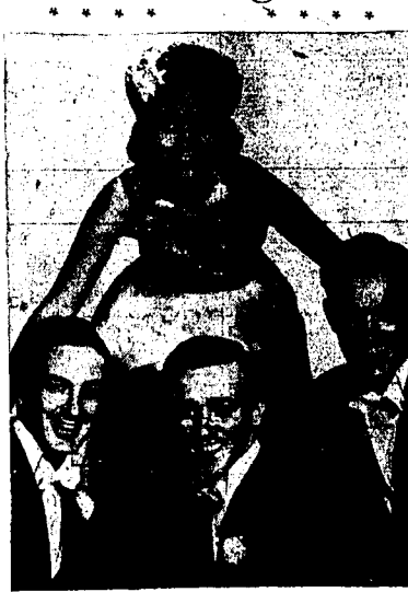
This foursome, the musical Merry Macs, started the nation singing the hit "Hut-Sut Song"...

WASHINGTON, Aug. 16 (UP)—The oil industry is planning to double its refining capacity for 100 octane aviation gasoline to assure sufficient stocks for military aviation.