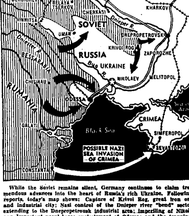
While the Soviet remains silent, Germany continues to claim tremendous advances into the heart of Russia's rich Ukraine. Following reports today: Capture of Krivoi Rog, great iron ore and industrial city; Nazi control of the Dnieper river "bend" section, west of the Dnepropetrovsk industrial area; impending of Nikolayev, important naval base; encirclement of Odessa; and the trapping, and the capture, of Red armies which are declared to be "annihilated."