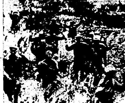
Radioed from Berlin to New York this picture shows, according to Nazi sources, German tanks and tank troops rounding up Russian snipers in a wheat field "somewhere on the eastern front" Berlin and Moscow agree there is intense fighting on both ends of the eastern front with Germans in possession of key cities in their drive toward Leningrad.