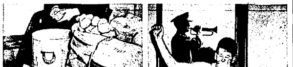
K.P. A man in a military uniform sitting at a table, possibly eating or drinking, with other people in the background.