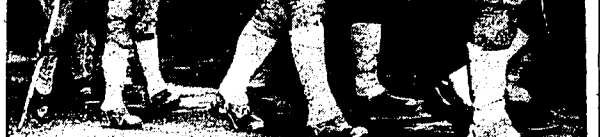
DUSTY DOGS A group of men in military uniforms, some in dress uniforms and some in work clothes, standing together outdoors.